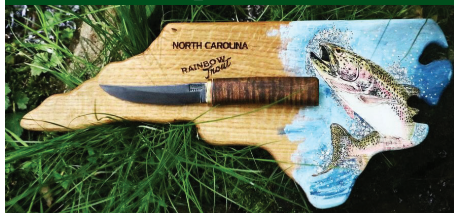
Board by Old-Sarge: Contact for more info on custom projects or requests.