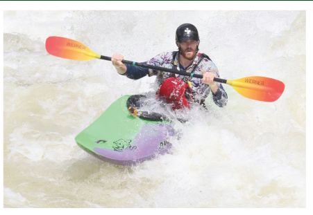
“Get and edge on life at Naylor Forge”